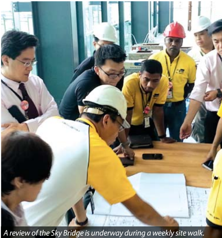
A review of the Sky Bridge is underway during a weekly site walk.

For more information, please visit www.vervesuites.com/klsouth .