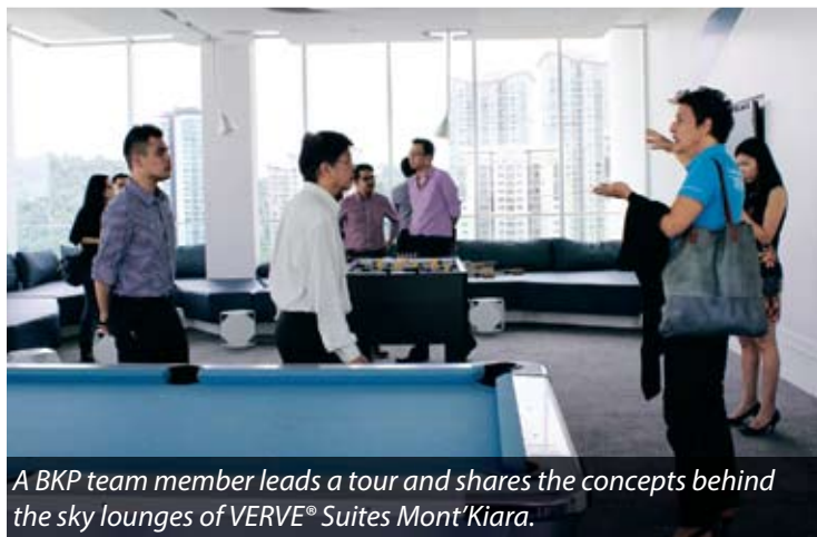
A BKP team member leads a tour and shares the concepts behind the sky lounges of VERVE® Suites Mont'Kiara.