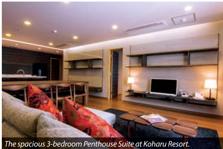
The spacious 3-bedroom Penthouse Suite at Koharu Resort.

For sales enquiries and room bookings, please visit www.koharuresorthotel.com .