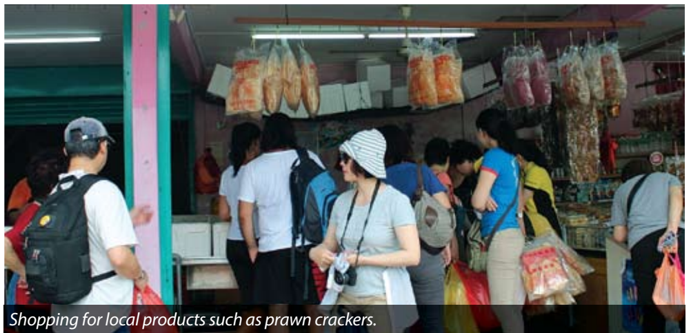
Shopping for local products such as prawn crackers.