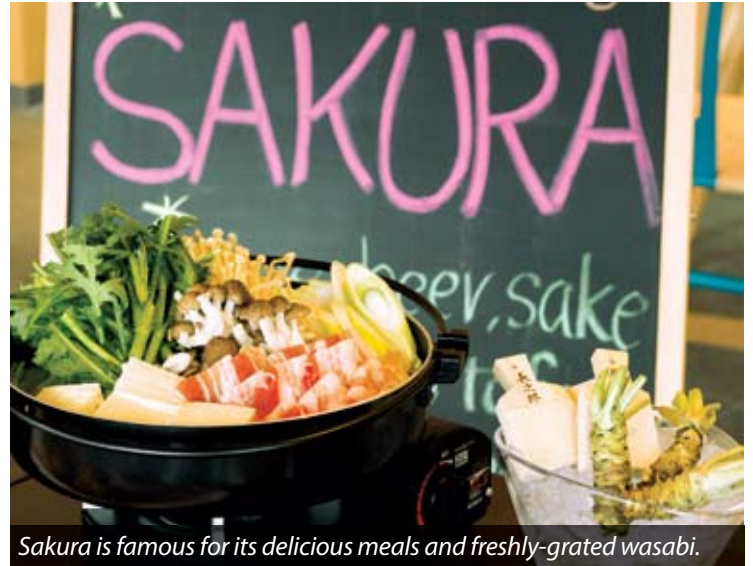
Sakura is famous for its delicious meals and freshly-grated wasabi.