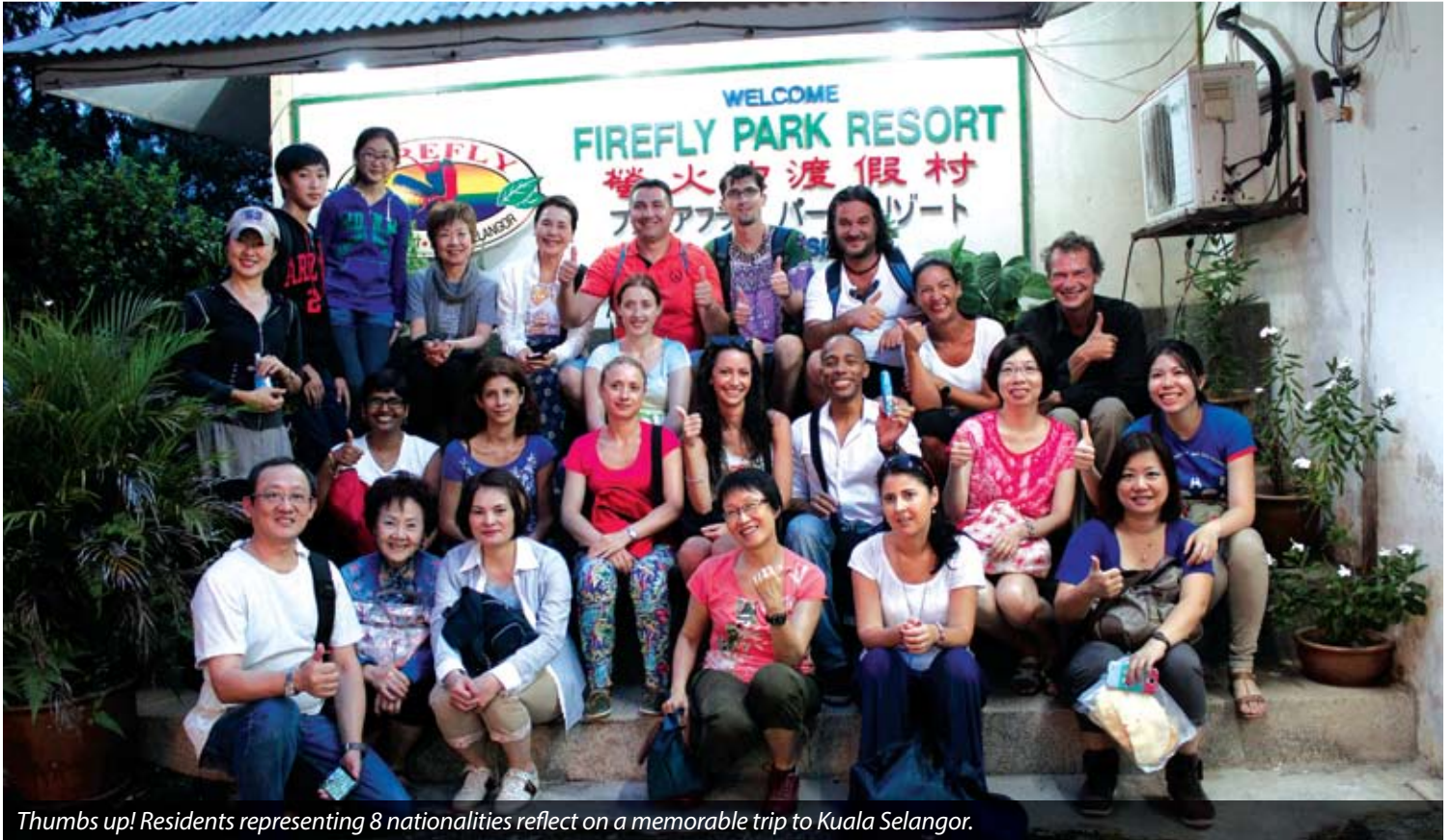
Thumbs up! Residents representing 8 nationalities reflect on a memorable trip to Kuala Selangor.

24 residents representing 8 nationalities from Hijauan Kiara and VERVE® Suites Mont'Kiara ventured to Kuala Selangor for eagle-feeding and a firefly tour organised by BKP recently.