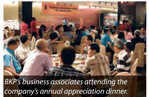
BKP's business associates attending the company's annual appreciation dinner.