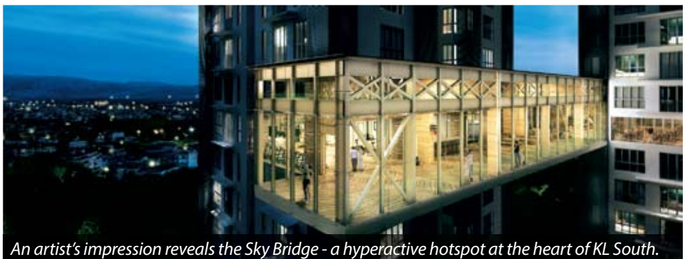
An artist's impression reveals the Sky Bridge - a hyperactive hotspot at the heart of KL South.

VERVE® Suites KL South houses 321 fully-furnished designer suites and 45 SOHO units. It is easily accessible via various highways and is a stone's throw away from major shopping malls such as Mid Valley Megamall and The Gardens, established private colleges and universities, and an extensive list of amenities.