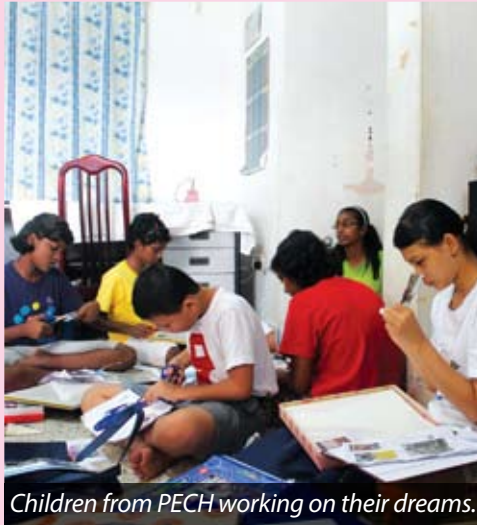
Children from PECH working on their dreams.