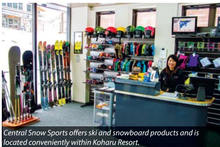
Central Snow Sports offers ski and snowboard products and is located conveniently within Koharu Resort.