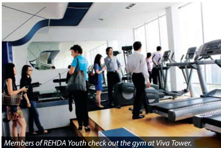
Members of REHDA Youth check out the gym at Viva Tower.