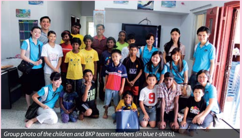
Group photo of the children and BKP team members (in blue t-shirts).