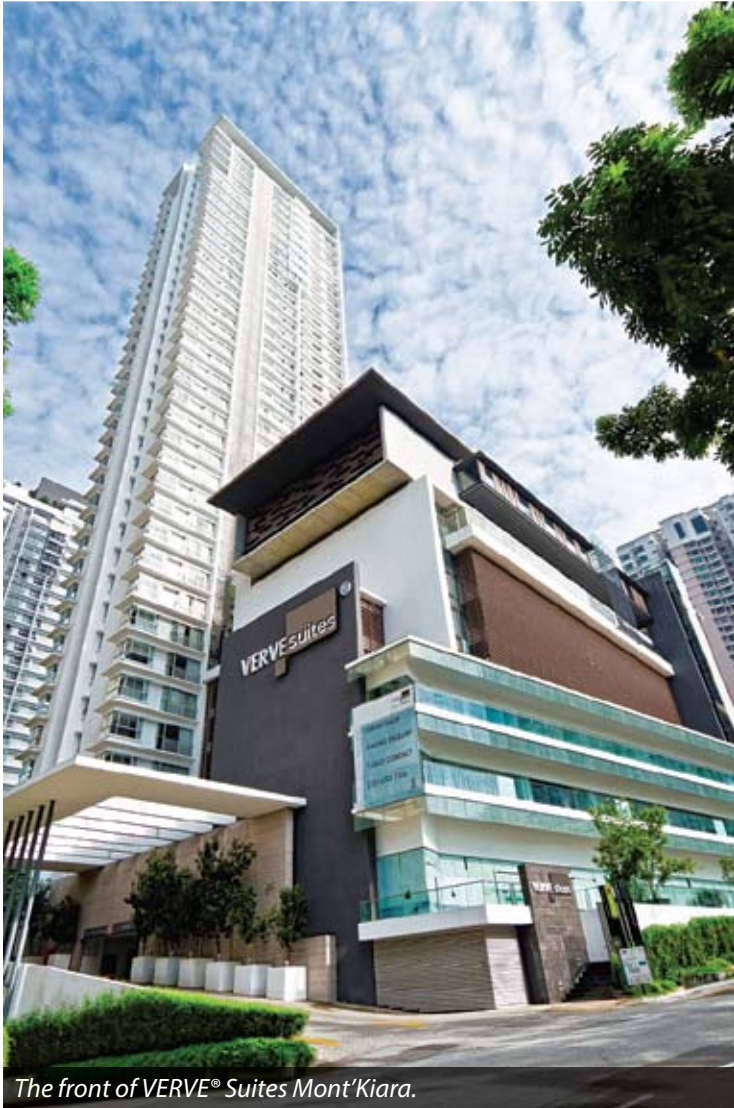
The front of VERVE® Suites Mont'Kiara.