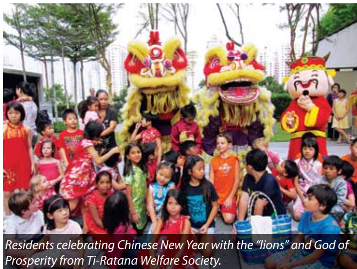
Residents celebrating Chinese New Year with the "lions" and God of Prosperity from Ti-Ratana Welfare Society.