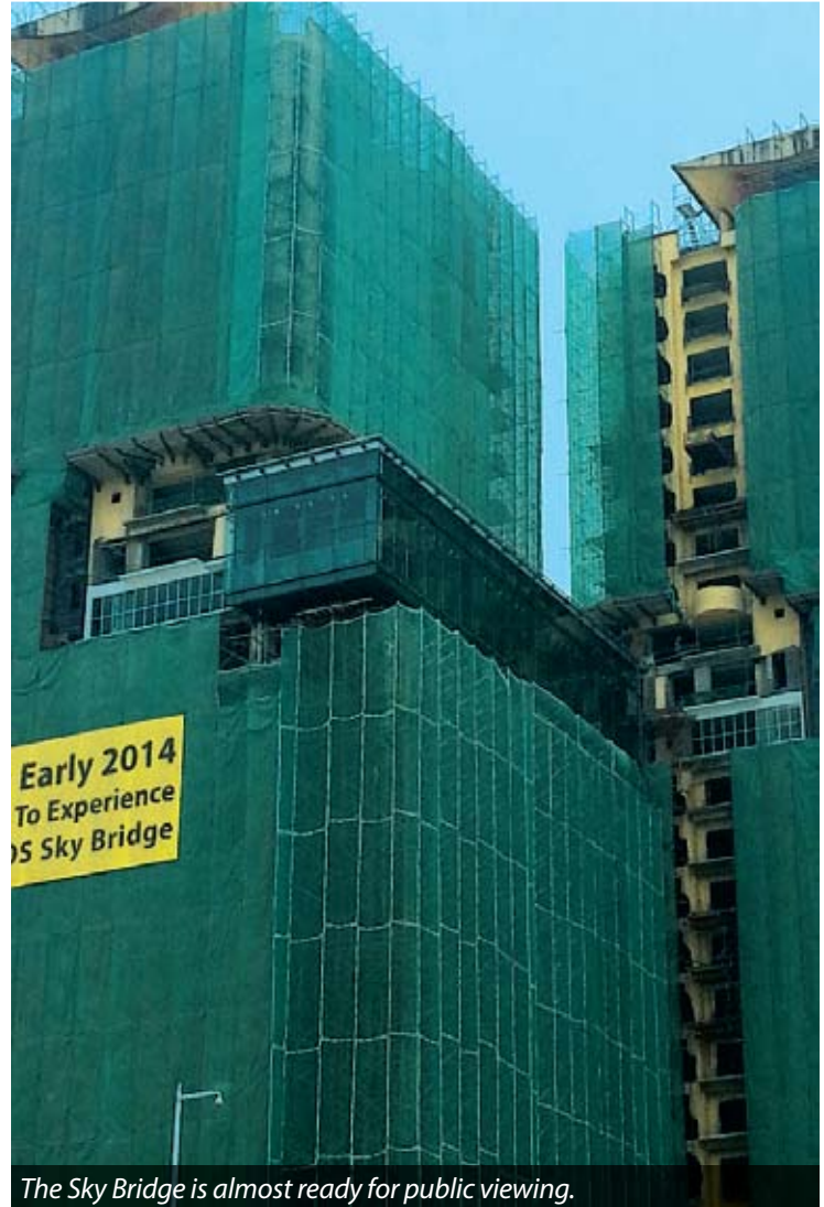
The Sky Bridge is almost ready for public viewing.