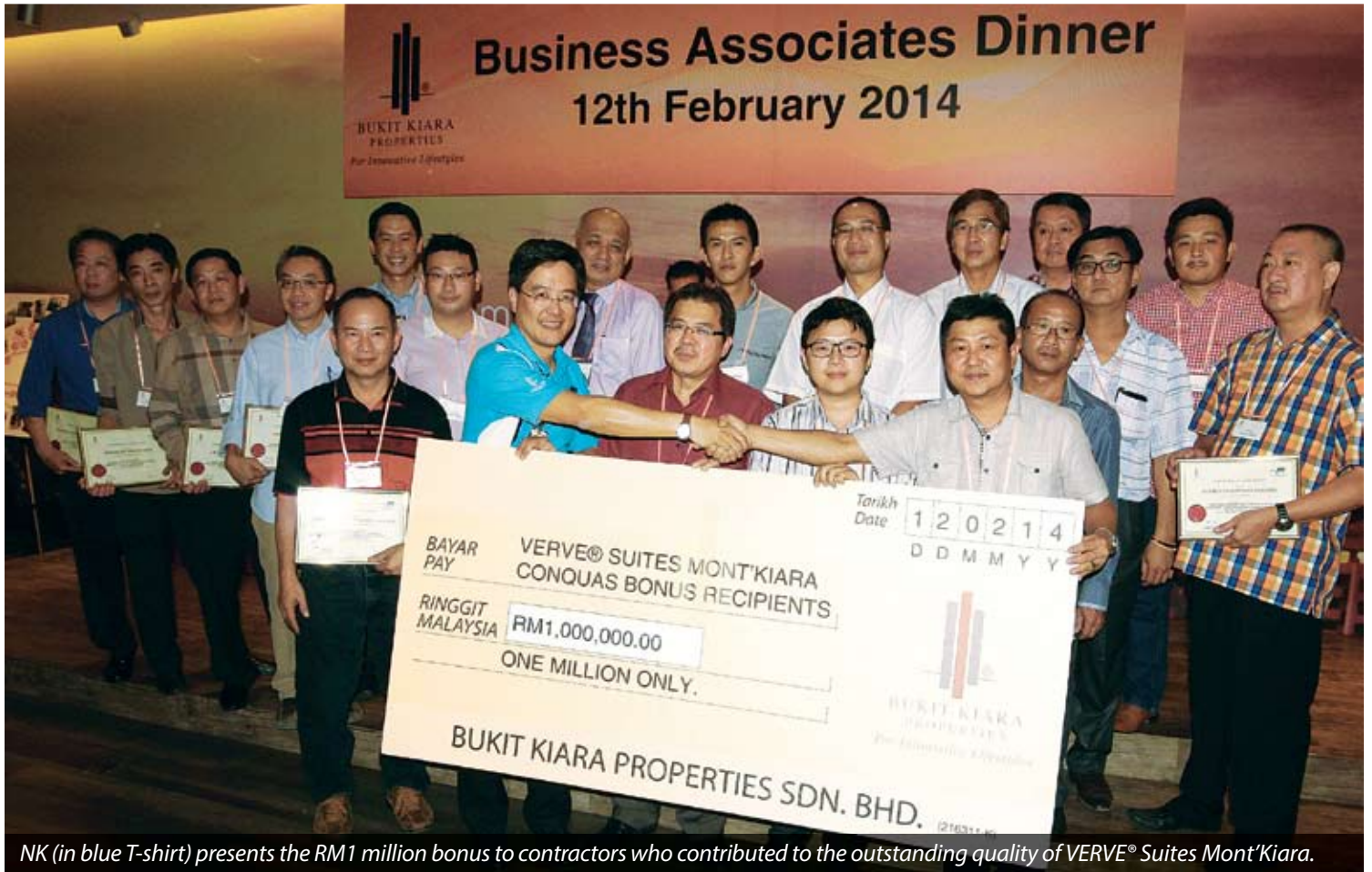
NK (in blue T-shirt) presents the RM1 million bonus to contractors who contributed to the outstanding quality of VERVE® Suites Mont'Kiara.