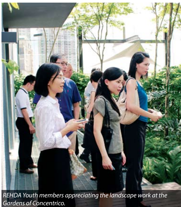
REHDA Youth members appreciating the landscape work at the Gardens of Concentrico.