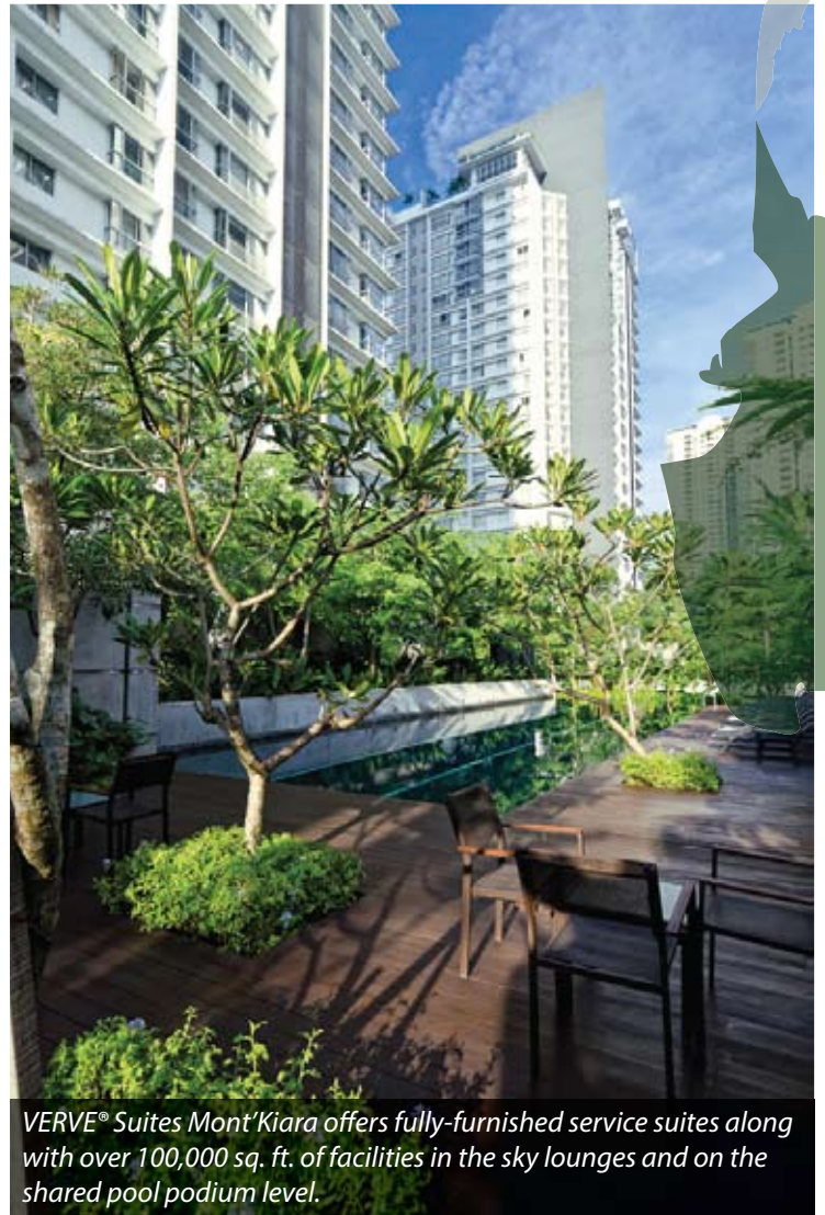
VERVE® Suites Mont'Kiara offers fully-furnished service suites along with over 100,000 sq. ft. of facilities in the sky lounges and on the shared pool podium level.