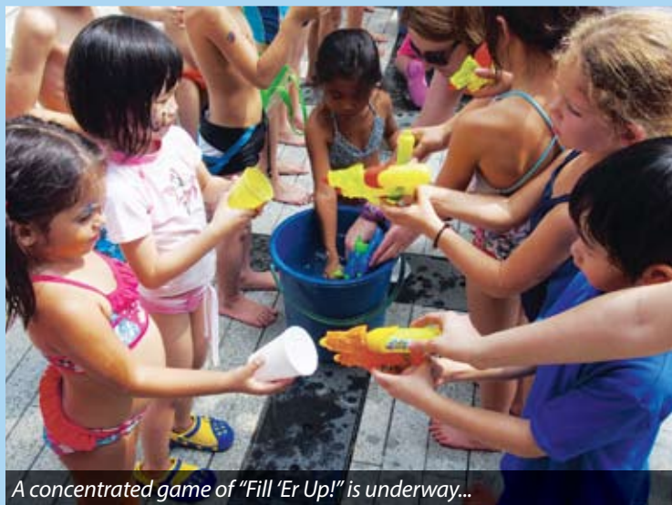
A concentrated game of "Fill 'Er Up!" is underway...

The children at Hijauan Kiara had an "egg-citing" time this Easter. Swimsuit-ready, they kicked off the celebrations at the children's pool by having a splashing fun time even before the first game of the day, "Rainbow Tag". After successfully searching out all the poster colours, the children got their faces painted, donning the Hijauan Kiara pool podium with rainbow hues.