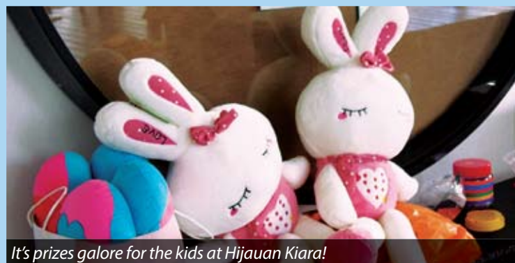
It's prizes galore for the kids at Hijauan Kiara!