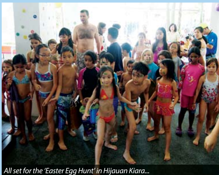
All set for the 'Easter Egg Hunt' in Hijauan Kiara...

Last but not least, everyone paired-up for a game of "Fill 'Er Up!" which required one teammate to squirt enough water into the other's cup with the given water gun. Apart from games, tattoo and manicure parlours were also set up for the children.