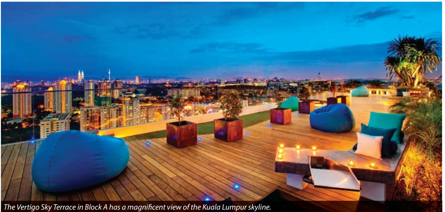
The Vertigo Sky Terrace in Block A has a magnificent view of the Kuala Lumpur skyline.