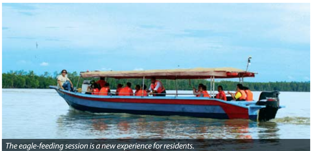
The eagle-feeding session is a new experience for residents.